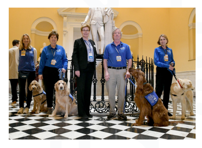
26 Reactions 2,906 Impressions